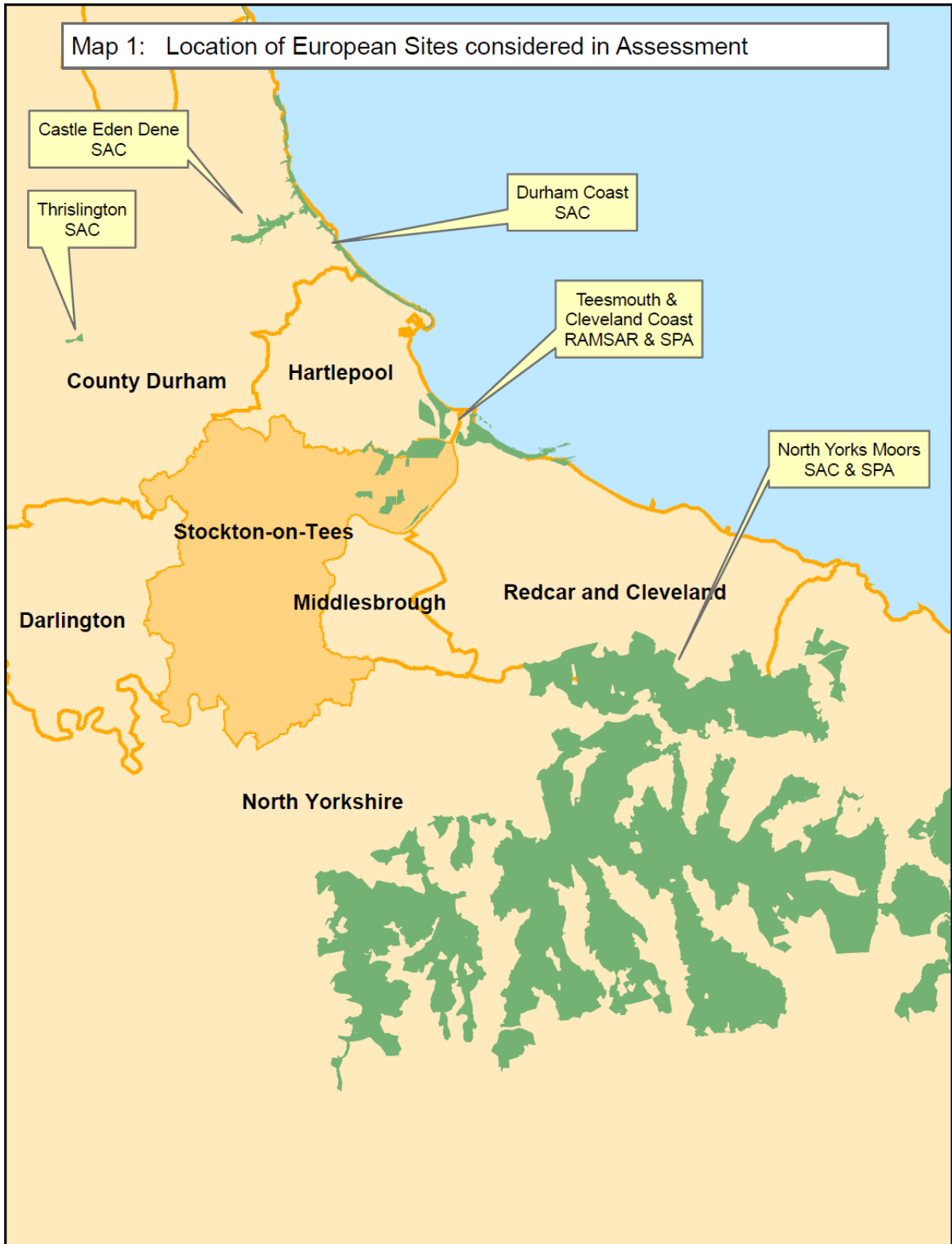
Map 1: Location of European Sites considered in Assessment